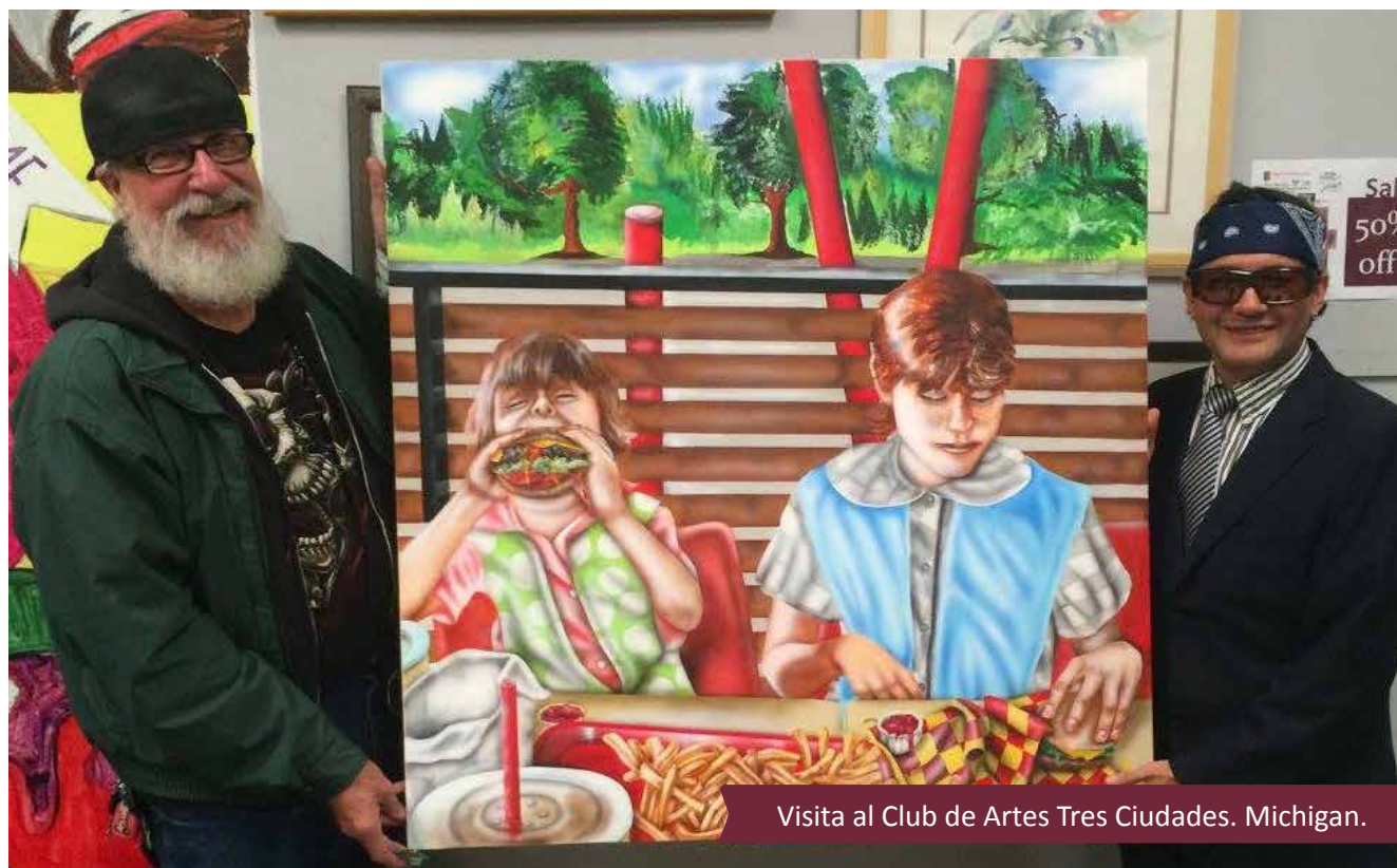
Visita al Club de Artes Tres Ciudades. Michigan.