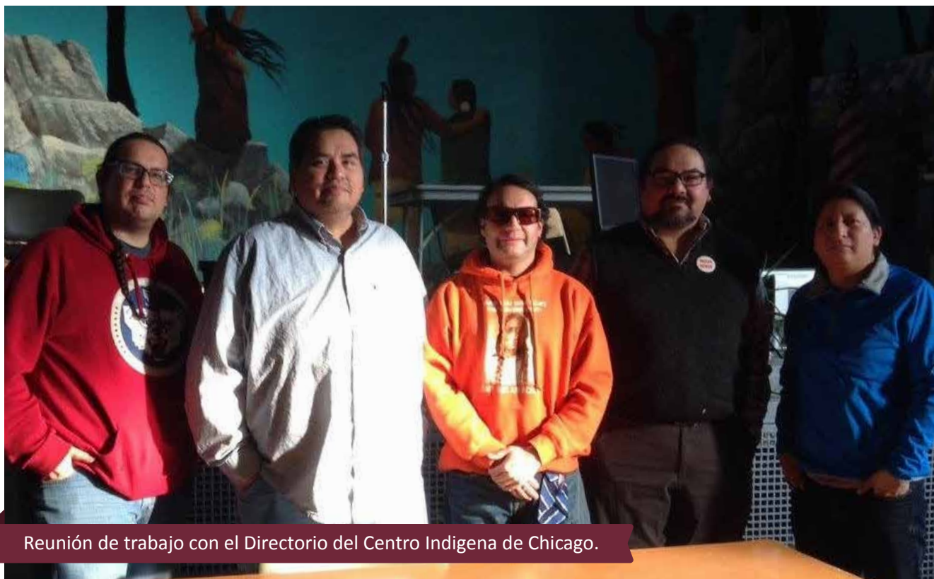
Reunión de trabajo con el Directorio del Centro Indigena de Chicago.